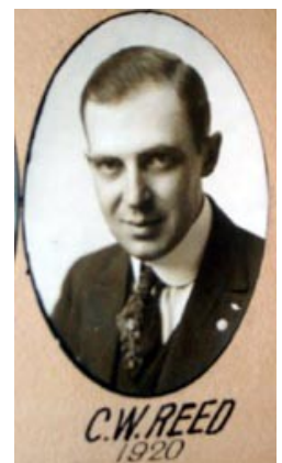
Attorney, World War I Vet United States Representative

He died February 9, 1956 in Bethesda, Montgomery County, Maryland and interment was made in the Glen Oak Cemetery, West Chicago, Illinois. Mason Funeral Services were performed by members of Euclid Lodge with the Grand Master of the State of Illinois presiding.